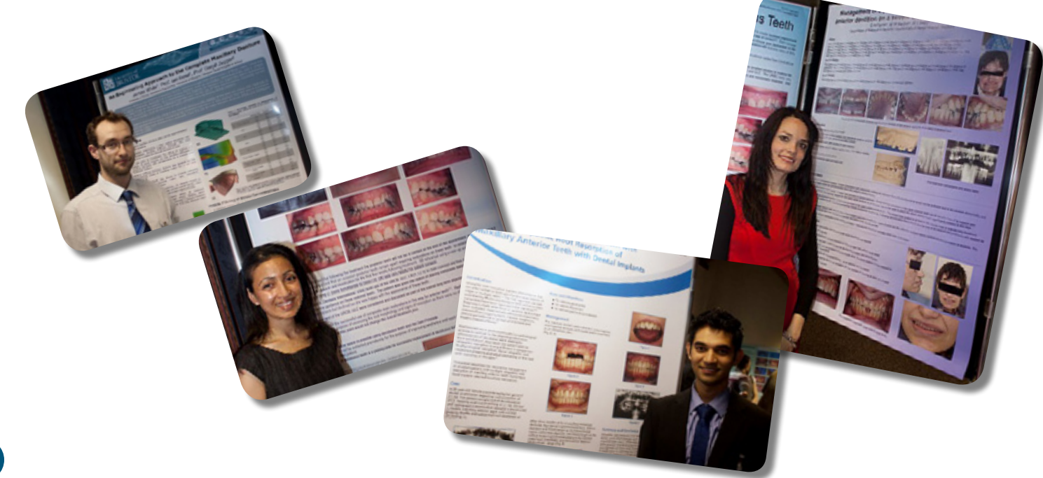
For full terms and conditions, further information, and application details for all the Society Prizes, please visit:

Closing date: 27th January 2012 Closing date: 14th January 2012