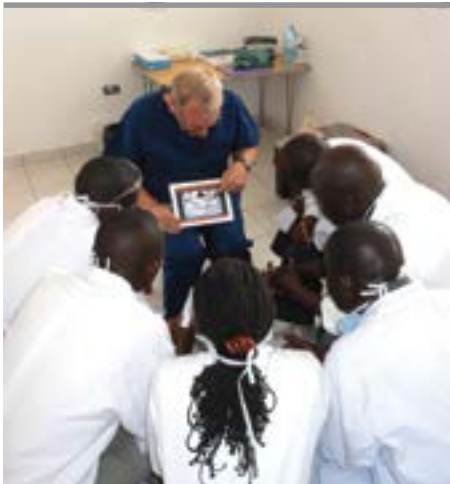
Modern technology tutorial

This was a trip which, somewhat late in the day, provided me with a rather different perspective. Organisation of trips from the UK and on the ground in Tanzania by Bridge2Aid is meticulous and I can thoroughly recommend dental volunteering to those with a sense of adventure. Funding is crucial and contributions can be made directly to Bridge2Aid.