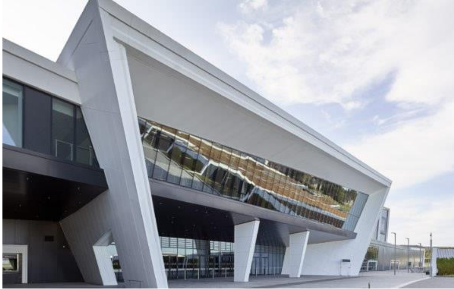
P&J Live - Scotland's brand new, state-of-the-art events venue where the BSSPD 2022 Conference will be held